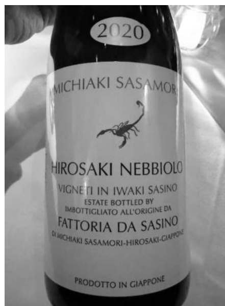
A noteworthy Nebbiolo